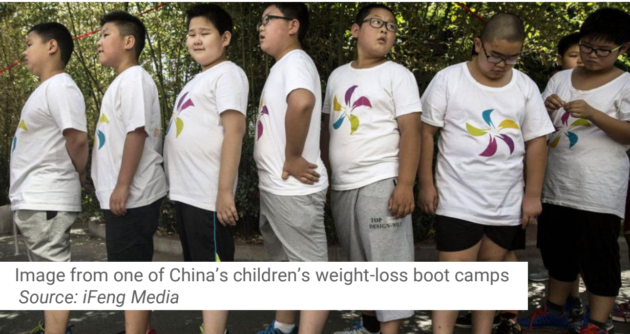
Image from one of China's children's weight-loss boot camps

... But the CAGR of childhood overweight prevalence is 2.5X higher!